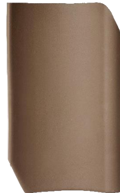
RT 807 (Brown tile)