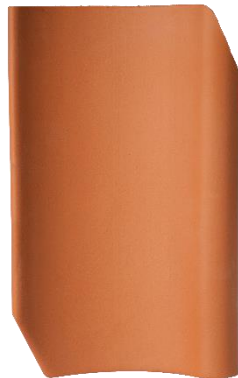
RT 806 (red tile)

The illustrated products below are examples of products covered by this EPD.