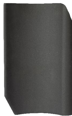
RT 810 (Damped tile)